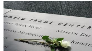
Michael Arad and Peter Walker Reflecting Absence The Sept. 11 Memorial 2004-2011.

* Faces of the Met . Shown from L to R, details from: