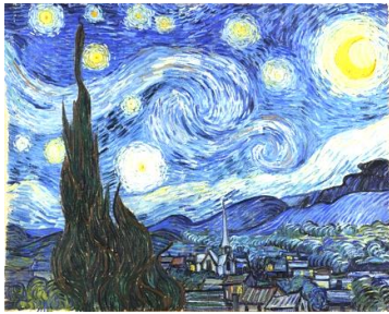
Vincent van Gogh Starry Night , 1889 Museum of Modern Art