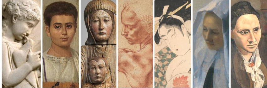
Faces of the Met*

An Exclusive Learning Adventure for OLLI Members at Colorado State University Program # 8864 – All-Art Experience in New York City: Met, MoMA and More Saturday, October 2 to Friday, October 8, 2027