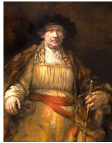
Rembrandt van Rijn Self Portrait , 1658 The Frick Collection